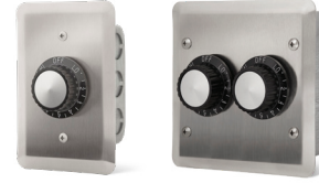
14-4200 Single SS Wall Plate w/ Deep Gang Box 14-4205 Dual SS Wall Plate w/ Deep Gang Box

IN-WALL FOR INDOOR OR PROTECTED OUTDOOR AREAS