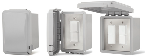
14-4320 Single Surface Mount w/ Weatherproof Box 14-4325 Dual Surface Mount w/ Weatherproof Box

INF INPUT REGULATORS are designed for use with single element heaters.