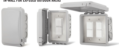
14-4310 Single Flush Mount w/ Weatherproof Cover 14-4315 Dual Flush Mount w/ Weatherproof Cover