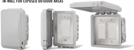
14-4410 Single Flush Mount w/ Weatherproof Cover 14-4415 Dual Flush Mount w/ Weatherproof Cover