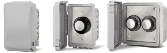
14-4210 Single Flush Mount w/ Weatherproof Cover 14-4215 Dual Flush Mount w/ Weatherproof Cover