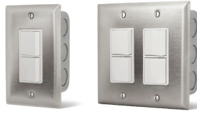
14-4300 Single SS Wall Plate w/ Gang Box 14-4305 Dual SS Wall Plate w/ Gang Box

IN-WALL FOR INDOOR OR PROTECTED OUTDOOR AREAS