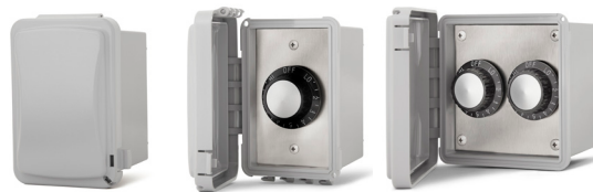
14-4220 Single Surface Mount w/ Weatherproof Box 14-4225 Dual Surface Mount w/ Weatherproof Box