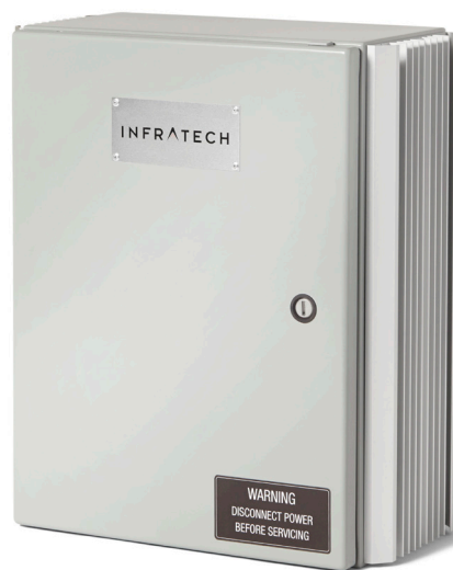
30-4047 3 Zone Analog Controller w/ Digital Timer