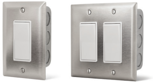
14-4400 Single SS Wall Plate w/ Gang Box 14-4405 Dual SS Wall Plate w/ Gang Box

IN-WALL FOR INDOOR OR PROTECTED OUTDOOR AREAS