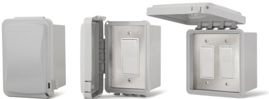
14-4420 Single Surface Mount w/ Weatherproof Box 14-4425 Dual Surface Mount w/ Weatherproof Box

DUPLEX STACK SWITCHES are designed for use with WD-Series dual element heaters.