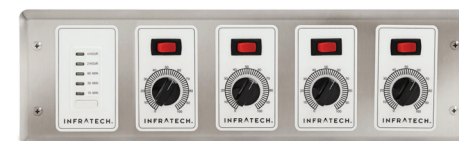
30-4048 4 Zone Analog Controller w/ Digital Timer