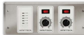
30-4046 2 Zone Analog Controller w/ Digital Timer