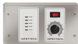
30-4045 1 Zone Analog Controller w/ Digital Timer